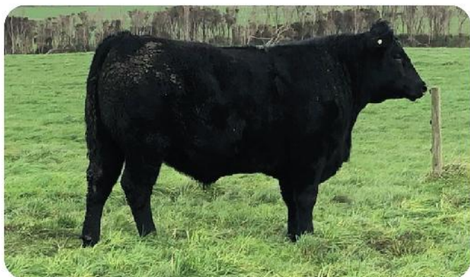
Pictured is a Milk Tooth Raff bred steer from the above consignment that yielded a carcass weight of 452kg with a Marble Score 4 and MSA Index of 67.51. He returned $3,273.32

Full brothers to our rising two-year-old sale bulls selling August 23rd were processed through the JBS Longford Plant Tasmania in late June. These were the complete group of spring born steers and represented the bottom 50% of all male calves born in that contemporary. With an average age of 21 months, they boasted an average carcass weight of 355kg. Comparing these 59 Raff bred steers Nationally against the 2,211 bodies processed that same day – steers only, no HGP, Grass Fed, Ossification <230 – our steers had more marbling, more fat, a higher MSA Index and, with the same ossification score, a 35-kilogram heavier carcass weight. At that day's grid of $7.40 it equated to $259 per carcass more value or nearly $10,000 extra for the two-deck trailer load. The complete consignment averaged $2,638 per head (topping at $3,273) with a two-deck trailer load of 38 steers grossing $100,245.