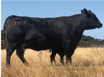
She sells – Raff Blackbird J173

Both sales sell on property by 'open cry' auction through the ring and interfaced with Elite Livestock & AuctionsPlus – your choice. Catalogues will be posted to those who request by late July. Individual lot videos will be available early of August.