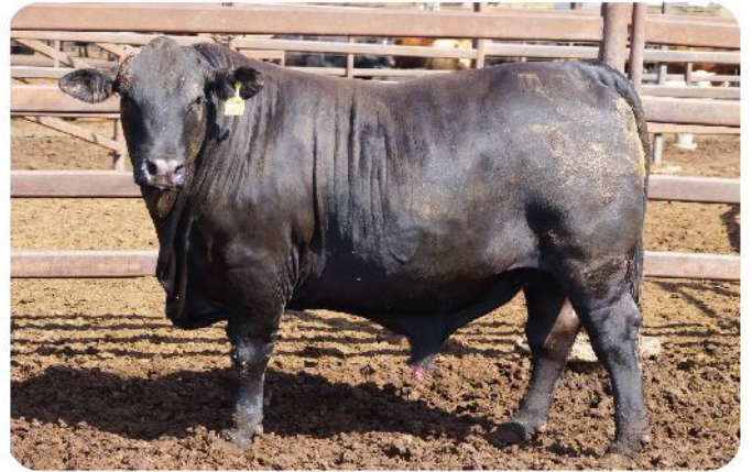
Pictured is the Champion Weight Gain Steer. Sired by a Raff Angus sire he gained 3.96kg/day after 100 days on feed