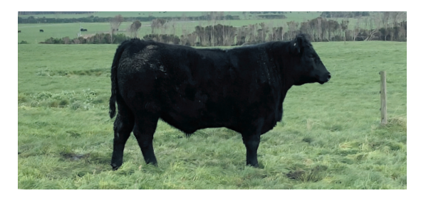
Raff Angus Certified Organic steers that were $738 per head more profitable.

The below information details where Raff Angus cull females sat when benchmarked against the NATIONAL COMPARISON for all females processed over the past twelve months sorted with an ossification >230, Grass Fed, no HGP.