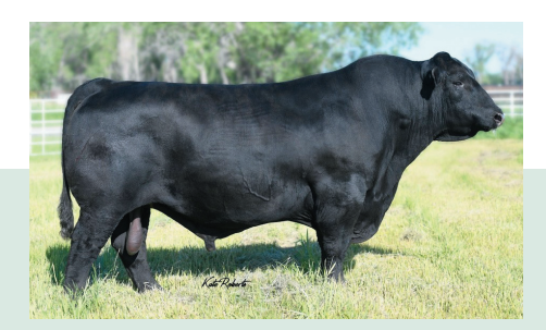
Jindra Megahit (USA)