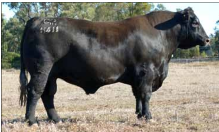
Hercules was the grand champion Angus bull and third placing interbreed champion bull at this year's Beef Australia event in Rockhampton